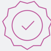
Change Management Health Checks & Quality Assurance