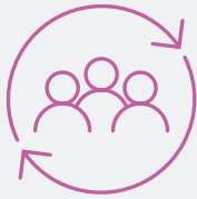
Provision of Change Managers